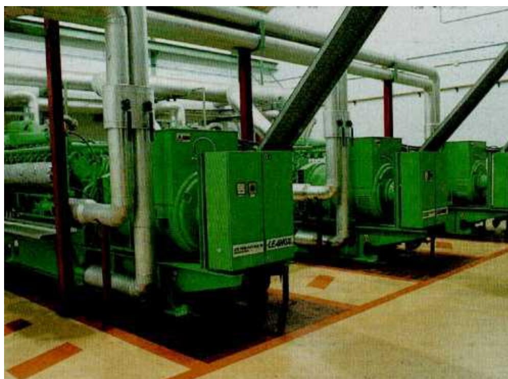
Figure 22: Block CHP plant with modular construction

Figure 22 shows an example of modular concept.